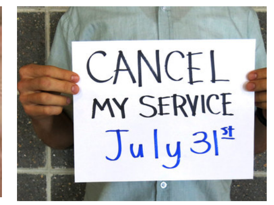
Cable TV Is Dying. Here's What Comes Next The Motley Fool