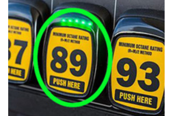
Drivers Feel Foolish For Not Knowing This New Rule US-Quote.com

All user comments are subject to our Terms of Service. Users may flag inappropriate comments. Y SPONSORED