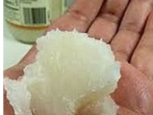
How Coconut Oil Could Change Your Life Healthy Lifestyle Daily