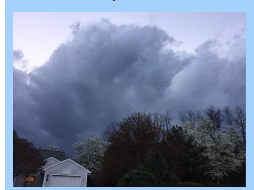
Stunning photos show severe storm